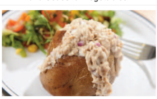
Filled Jacket Potato with a Selection of Fillings Served with Salad