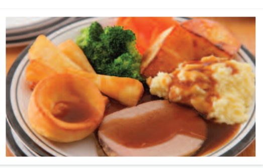
Roast of the Day/Quorn Fillet with Roast/Mashed Potatoes , Seasonal Vegetables and Gravy