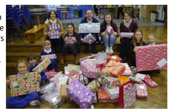
Caring for All, Committed to Excellence

wonderful expression of our love for others this Christmas.