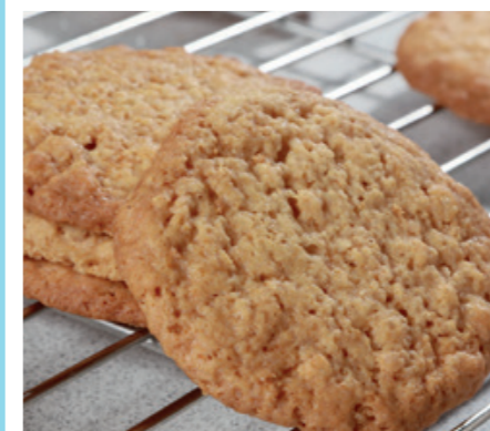
Rice Crispy Cookie