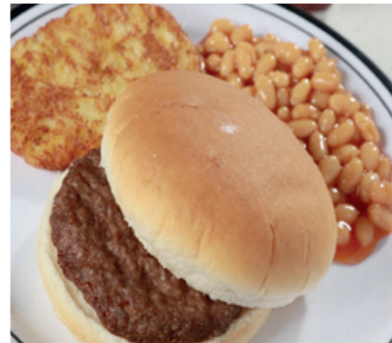
Beef Burger in a Bun, Hash Brown served with Baked Beans or Seasonal Vegetables