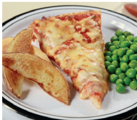
Thin & Crispy Margherita Pizza (V) served with Potato Wedges, Baked Beans, Seasonal Vegetables or Coleslaw