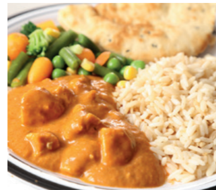
Chicken in a Katsu Curry Sauce served with Rice, Naan Bread & Seasonal Vegetables