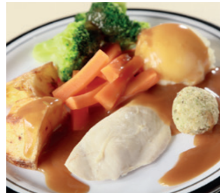
Roast Chicken Lunch served with Roast/Mashed Potatoes, Seasonal Vegetables & Gravy