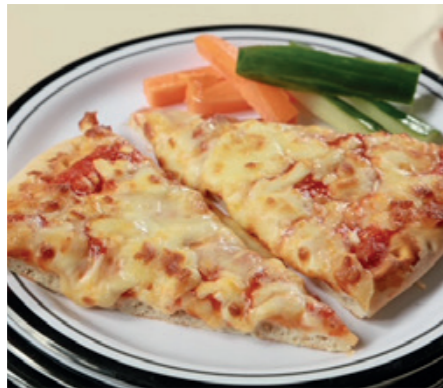
2 Slices of Thin & Crispy Cheese & Tomato Pizza (V), served with Baked Beans, Seasonal Vegetables or Coleslaw