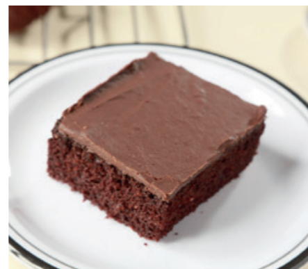
Iced Wacky Chocolate Cake