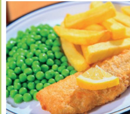
Battered Fish served with Chips, Baked Beans or Peas