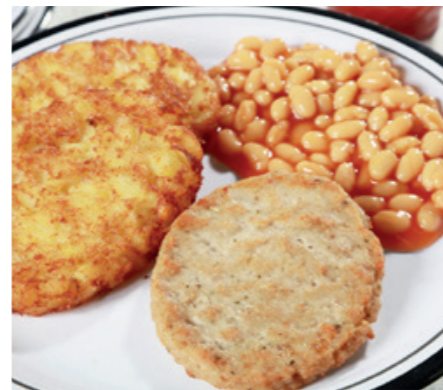
Sausage Pattie Brunch served with Hash Browns & Baked Beans