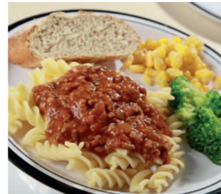
Pasta Bolognese served with Crusty Bread & Seasonal Vegetables