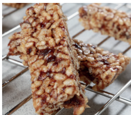
Caramel Crispy Bar