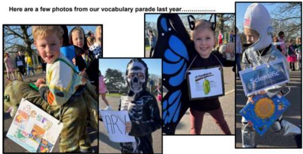
Here are a few photos from our vocabulary parade last year.....

Children are invited to come dressed as a word that represents who they are and what makes them SHINE. We had so many creative ideas last year and we are really looking forward to seeing the children SHINE again this year.